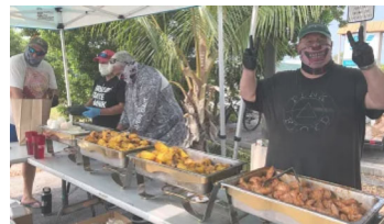
Helping each other through difficult times April 27, 2020