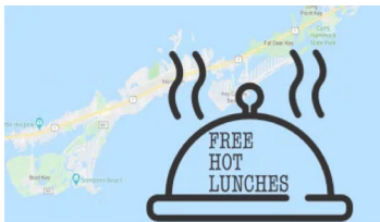
Free food at Brutus on Saturday April 3, 2020

To support the cause, drop off a check to any First State Bank location in the name of Mangrove Mike's Endeavors Paying Forward or to Mangrove Mike's Cafe located at 82200 Overseas Hwy., Islamorada between 9 a.m. to noon. Donations are also accepted over the phone, by calling 305-664-8022. Checks can be mailed to P.O. Box 1459, Islamorada, Florida 33036. To donate online, visit mangrovemikesendeavors.com .